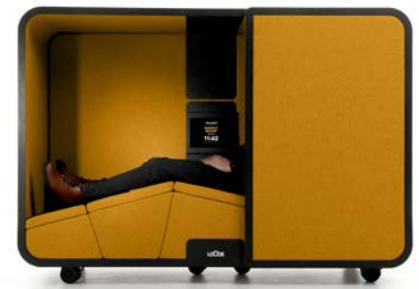
602/602S NEUROPOD W/ PRIVACY SCREEN